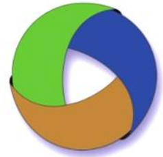
Republic of Iraq