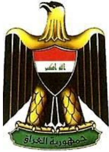
Republic of Iraq