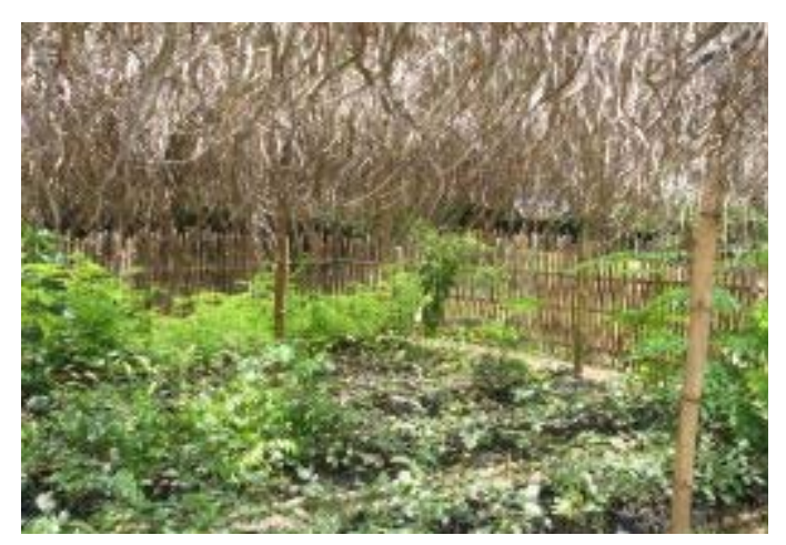
The tree nursery at Tafi Atome