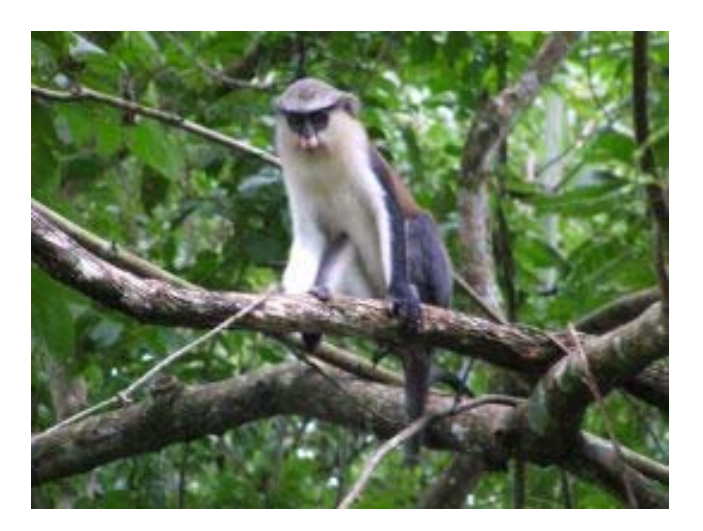
A Mona monkey at the Tafi Atome Monkey Sanctuary

A fourteen-member Project Management Committee comprising representatives of the traditional authorities and the four major communities (Tafi Atome, Tafi Mador, Abuife and Vakpo-Fu) has played a key role in the project's