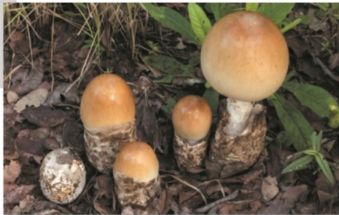
Volume 17 (2017)