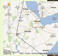
Fig. 1 Study area